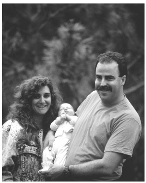
Maxine and Maxwell (Minimum is the in the middle)

Puzzle #31: Does every infinite set of real numbers have a maximum?